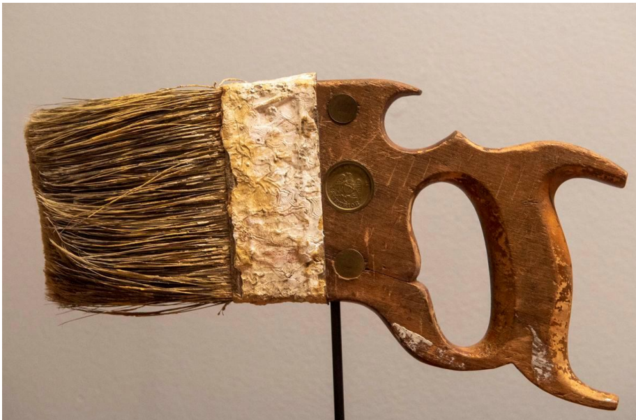
Howard Jones: "Crosscut Saw Handled Brush", Jeb Wallace-Brodeur / Staff photo

Being in the spaces, one feels a sense of intimacy. Many works of art are placed on exquisitely crafted furniture, others hung on the wall in salon-style fashion. There is a resonance and conversation between the pieces. It is impossible not to be filled with wonder at the marvels of creative expression. It is an uplifting experience, a journey filled with the possible, never knowing what unique treasure might be revealed next.