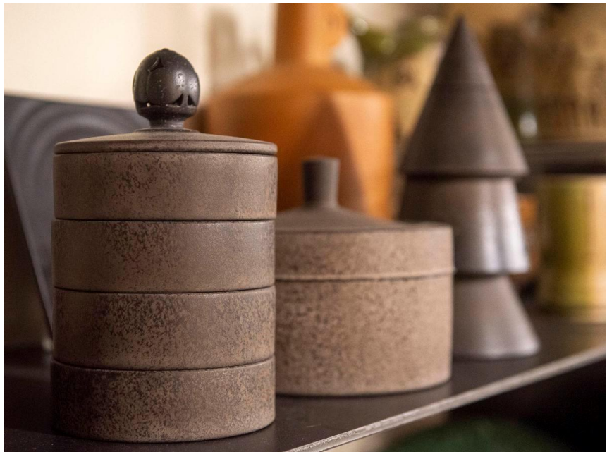
Ceramics by Romulus Craft

The art that I was exposed to at a young age, mainly through my Mom's influence and interests, was a "cultural inoculation" that worked. Years later, it has been one of the great points of focus in my life. My father passed away the summer after my 16th birthday. If I were to make a psychological projection, I would suspect that collecting has been a way to both honor my Dad, as well as to accomplish some things that I think he would have been excited to see materialize. What has happened would have been impossible for my parents to imagine.